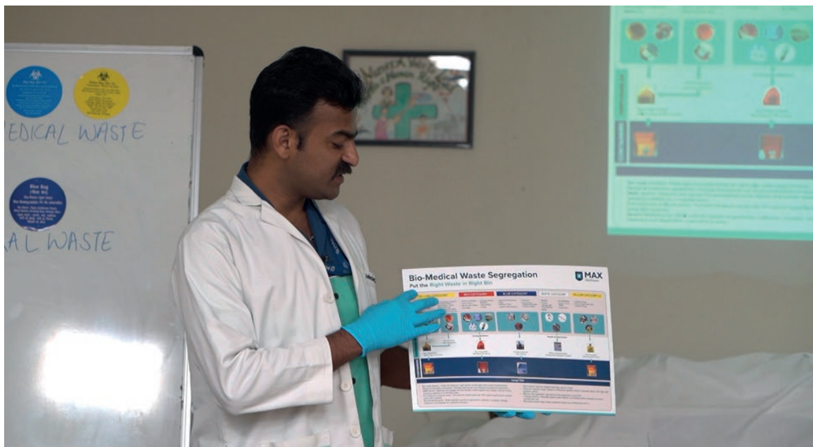
Training of healthcare staff and waste workers on bio-medical waste management

Max Healthcare follows the key principle of segregation as the foundation of an efficient hospital waste management system. The hospital segregates waste into four categories as per schedule I of Bio-Medical Waste Management Rules, 2016 and Guidelines for Management of Healthcare Waste as per Biomedical Waste Management Rules, 2016 by CPCB and Ministry of Health and Family Welfare. The hospital has marked designated waste generation areas, and they have deployed trained and dedicated waste management staff to collect waste from these points. The collected waste is then stored in color-coded bags and bins and the intra mural transportation of waste is done on a daily basis in big colour-coded trolleys which are carried through areas with less human activity to avoid any potential health hazards. The waste is then stored in a common bio-medical waste storage area for not more than 48 hours. The waste is finally disposed of to a common biomedical waste treatment facility (CBWTF) called Biotic for disposal and treatment. Overall, the healthcare facility is committed to maintaining the highest standards of biomedical waste management to ensure the safety of both healthcare workers and the environment.