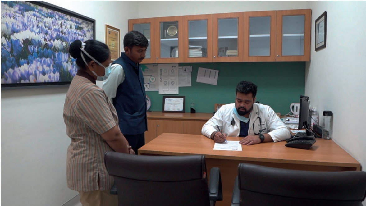
Needle stick injury reporting within the healthcare facility