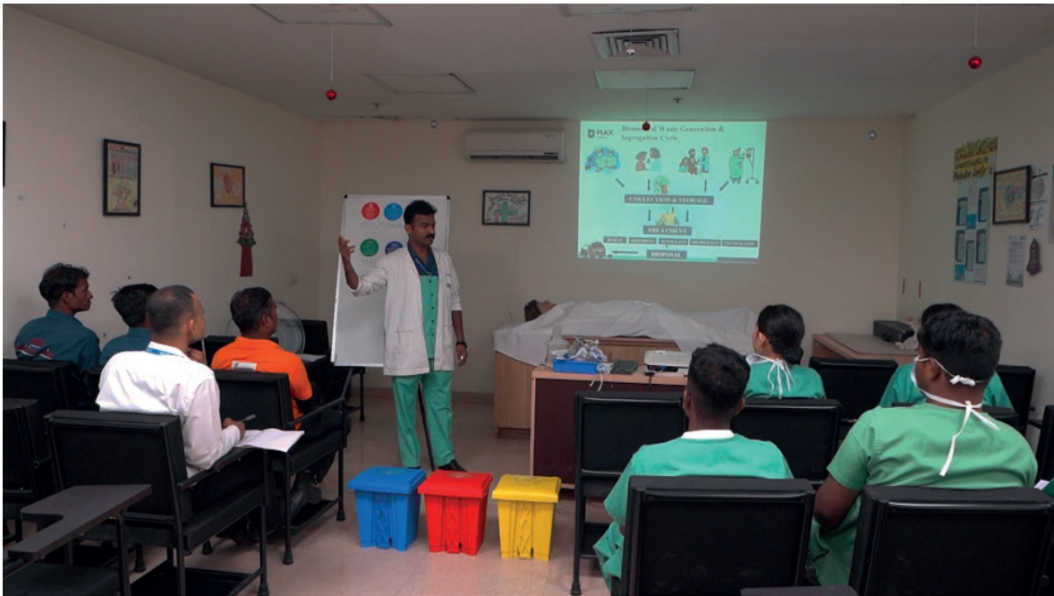
Training of healthcare staff and waste workers on proper handling and reporting of accidents