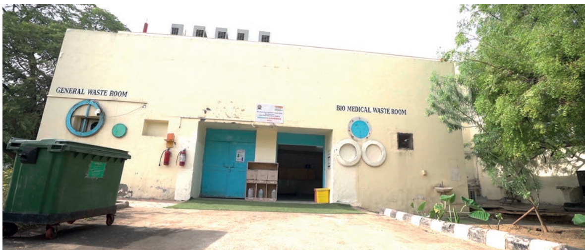
Bio-medical waste storage room for interim storage at Max healthcare

The above-mentioned units are the different areas of bio-medical waste generation that produce both hazardous and non-hazardous waste by carrying out antenatal and postnatal care, immunisation, routine patient care and treatment. Bio-medical wastes such as syringes and needles, cotton swabs, lancets and slides, ampoules, vials, blood and body fluids, broken glasses and gloves, liquid waste, placenta, soiled waste, chemotherapy waste from oncology, blades, masks, etc is segregated and collected from the units. To manage the waste generated a robust system of waste management is adopted at the centre, which is safe and for the healthcare workers and visitors. The waste management operation is easy to understand and operate and economically viable posing less or no adverse impact on health and the environment.