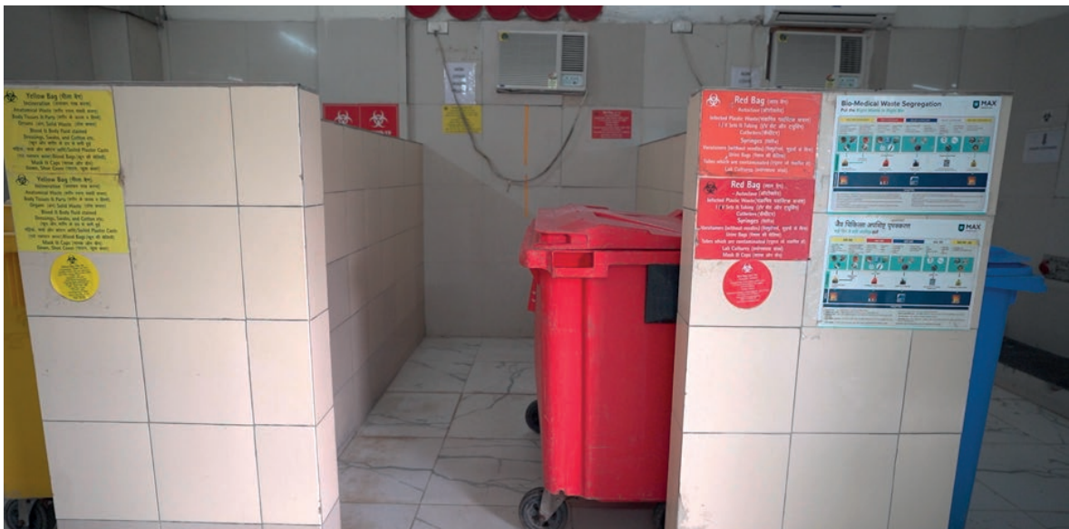
Well-labelled bio-medical waste storage room

Max Smart Healthcare Hospital's efforts in bio-medical waste management are appreciable. The hospital has implemented robust systems and processes to ensure proper handling, training, storage, transportation, and disposal of bio-medical waste. The recording of waste generation data and periodic analysis of the same reflects the hospital's commitment to continuous improvement and compliance with the Bio-Medical Waste Management Rules, 2016. Max Smart Healthcare Hospital serves as a model for other healthcare facilities